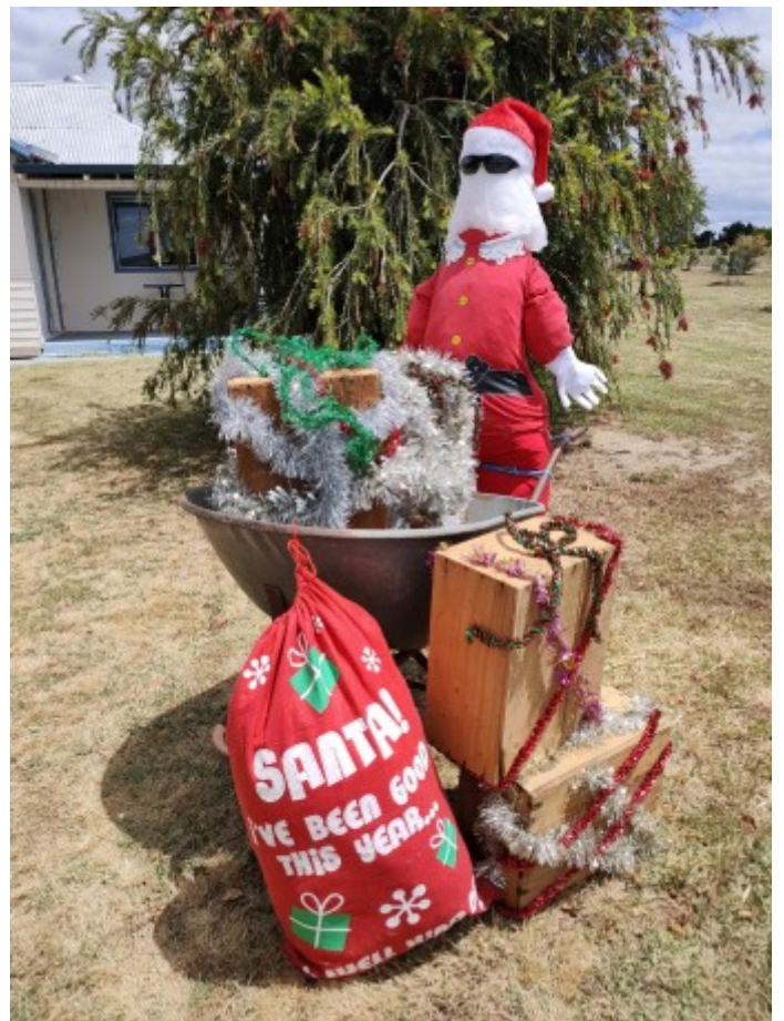
Frankland Rural's Christmas Display competition inspired some amazing festive displays around the district, brightening the landscape and bringing a smile as you passed by. Well done!