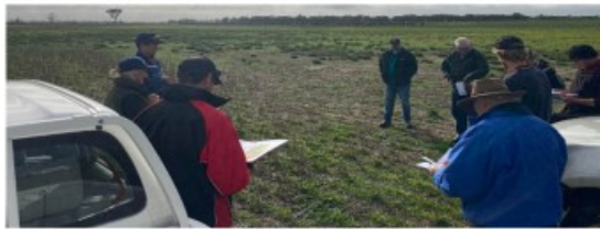
Core producers, DPIRD and Gillamii staff at one of the PDS sites discussing solutions

The sites are located throughout the Broomehill-Tambellup and Cranbrook shires, ranging from valley floors to areas further up the landscape in the transition zone of productive to salt affected soils. The motivation of producers to develop these areas into salt-tolerant pastures systems is to use both surface and ground water to manage the site's local salinity, while keeping the areas as productive paddocks, part of their various livestock enterprises.