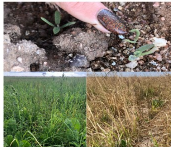
December 2022 (Three months after establishment)