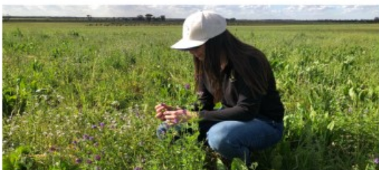
Gillamii Project Officer observing pasture establishment in October 2022

The outcome of these workshops were 4 different site designs and species mixes, two comprising of pastures with pre-established saltbush, one to be direct seeded with saltbush alleys and a pasture understory and the remaining to be planted with saltbush seedlings in alleys with a volunteer pasture understory.