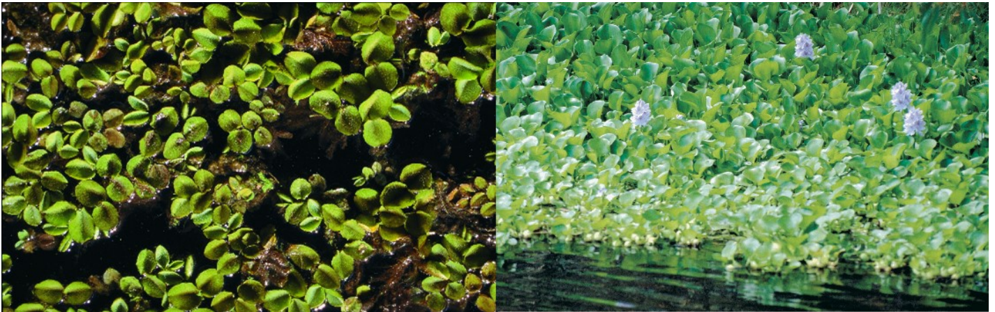
Left: Salvinia ( Salvinia molesta ) and right: water hyacinth ( Eichhornia crassipes ).