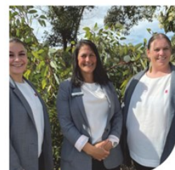
Meet your local team at Community Bank Tambellup Cranbrook

Find out more. Call Community Bank Tambellup Cranbrook on 9825 1333.